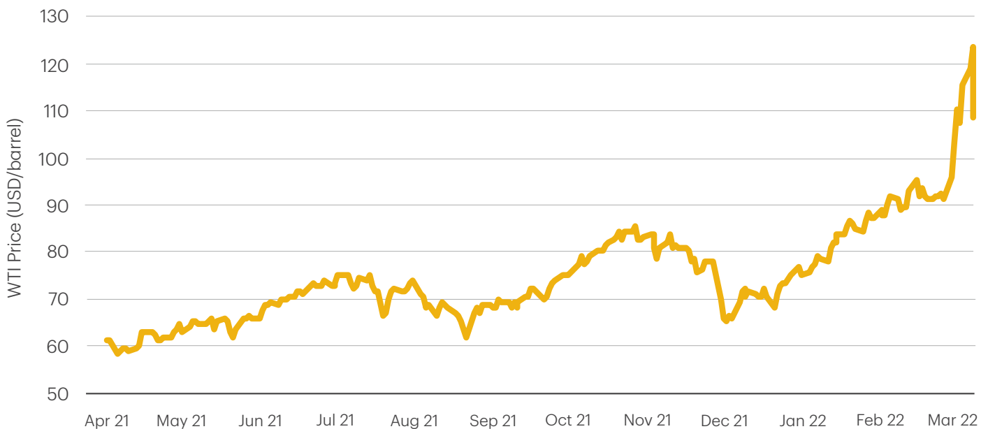
Chart 2: Oil Continues its Steady Climb

Source: WTI Crude Oil ($/barrel) from FactSet. As of March 7, 2022.